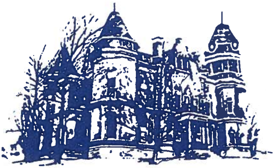
Fulton County Courthouse - 1903